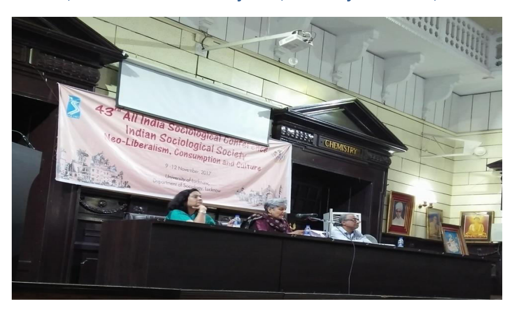
The GBM in Progress in Malaviya Hall, University of Lucknow (11<sup>th</sup> November, 2017)