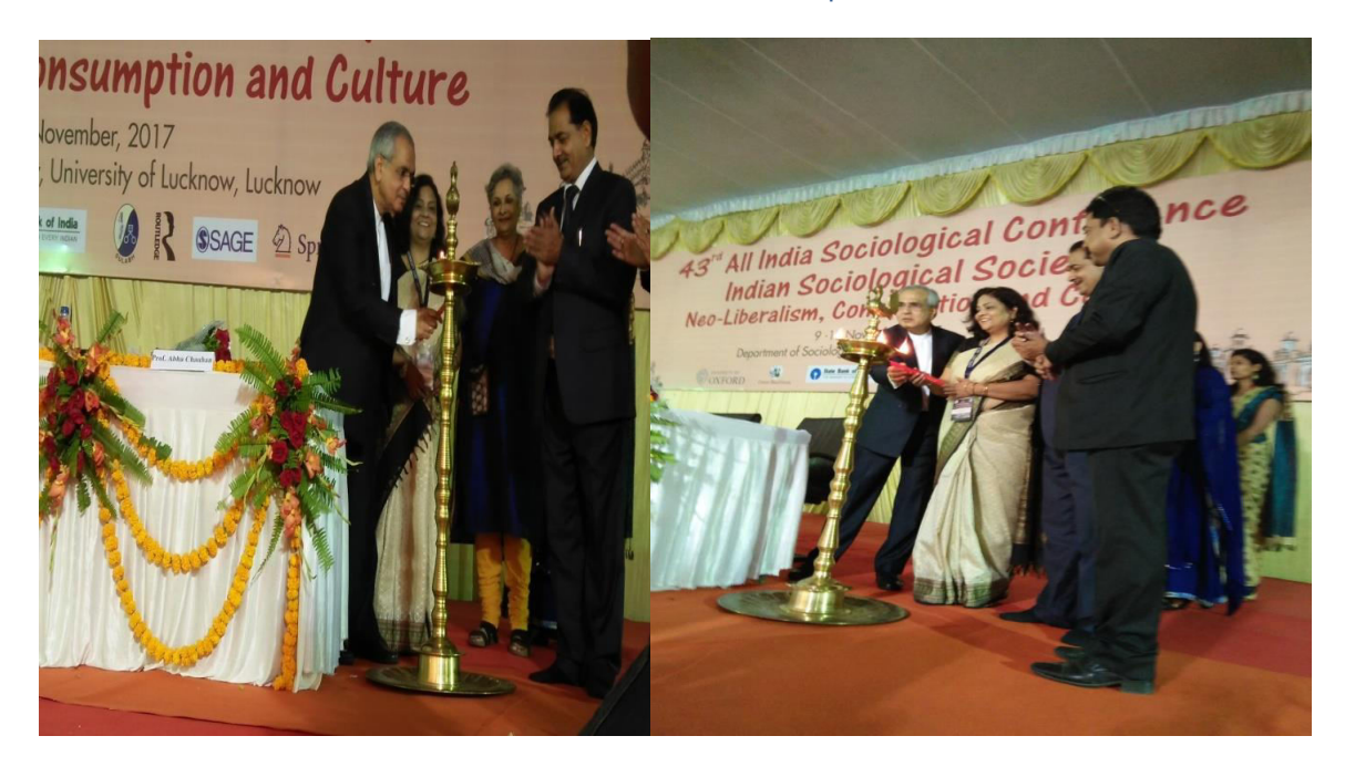
Inaugural Function: 43<sup>rd</sup> All India Sociological Conference, Lucknow (09 November, 2017)

The 43<sup>rd</sup>All India Sociological Conference of the Indian Sociological Society (ISS) was hosted by the Department of Sociology, University of Lucknow during 9-12 November, 2017. The theme of the conference was "Neo Liberalism, Consumption and Culture".