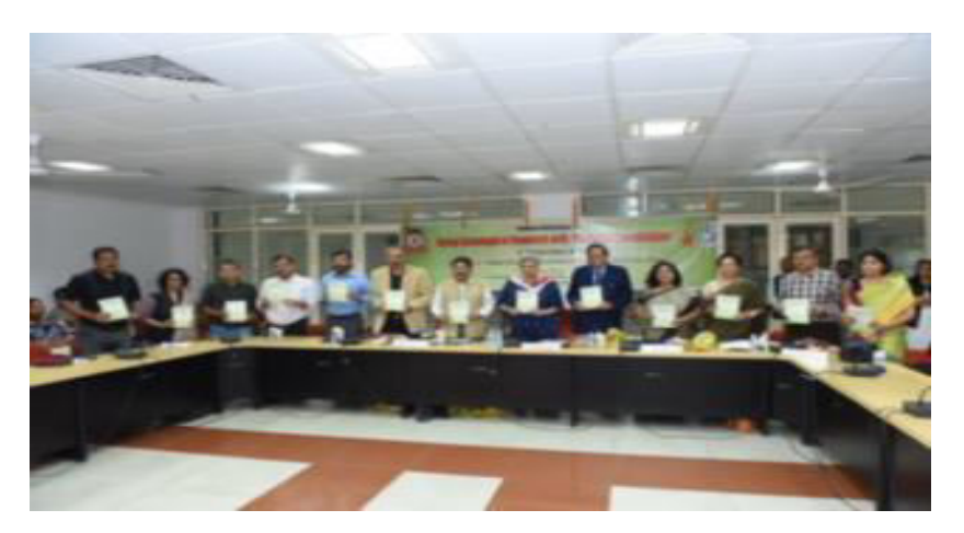
The Young Researchers Workshop

The Conference was preceded by the Young Researchers Workshop, which was a national level workshop on the theme "Doing Sociological Research with Historical Sensibilities" was held during 7-8 November, 2017 it was organized by Dr. Ram Manohar Lohiya National Law University, Lucknow along with the Indian Sociological Society. It was sponsored by the Indian Council of Social Science Research (ICSSR) New Delhi. More than fifty abstracts were received and through a process of selection by a committee of the experts, eighteen abstracts were selected for final presentation. To provide exposure to the students of Uttar Pradesh (U.P), the Head of Department of Sociology of the universities of Uttar Pradesh were requested to nominate three candidates (Ph.D. Scholars) from their universities to participate in the workshop. Thirty research scholars were nominated by the universities of Uttar Pradesh to participate in the workshop