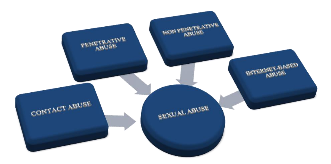
Figure 1. Types of Sexual Abuse

According to World Health Organization's Violence and Health in the WHO African Region Report (2010), 'sexual abuse is the involvement of a child in any kind of sexual liaison that he/she is unable to comprehend fully, is unable to give informed consent to, or for which the child is not developmentally prepared, or else that violates the laws or social taboos of society'. Broadly, sexual abuse is classified into four categories: non-contact, non-penetrative contact, penetrative contact, and internet-based sexual abuse (Figure 1). Non-contact sexual abuse includes any verbal or non-verbal references to sexual matters such as implicit or explicit invitations for sexual liaisons, being exposed to genitals, sexual acts, or sexually explicit materials, or being asked to reveal own genitals to someone else. Non-penetrative contact abuse comprises of being kissed or fondled sexually, caressing others' genitals or masturbating someone else or watching somebody masturbate, while attempting intercourse, oral intercourse, anal intercourse, and genital intercourse come under the preview of penetrative contact abuse (Elklit, 2015). The growth of the world wide web has exposed children to a new hazard of internet-based CSA comprising of creating, depicting or distributing sexual images of children online, stalking, grooming and engaging in sexually explicit behaviour with children through the internet (Pellai & Caranzano, 2015).